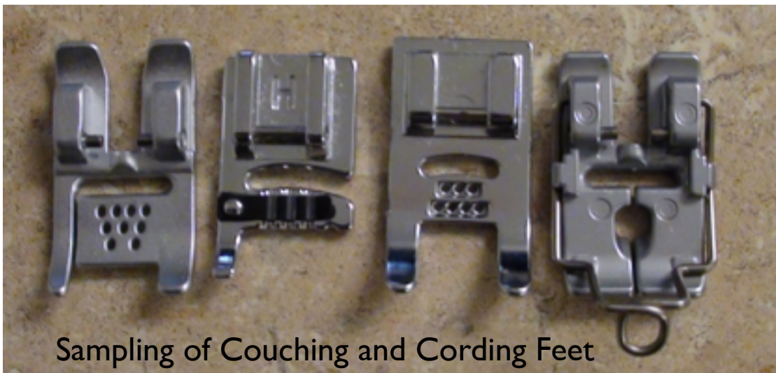
Sampling of Couching and Cording Feet