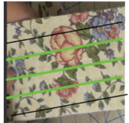
Channel quilting: Lines 1/2" apart